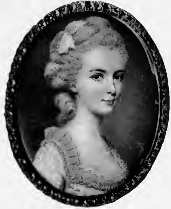
PORTRAIT OF A LADY (NAME UNKNOWN) BY JOHN SMART